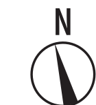
1 BHK TYPE 02 - B