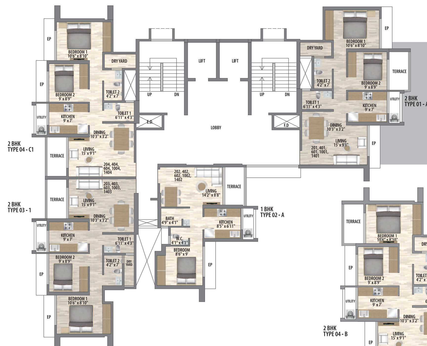
2 BHK TYPE 04 - C1